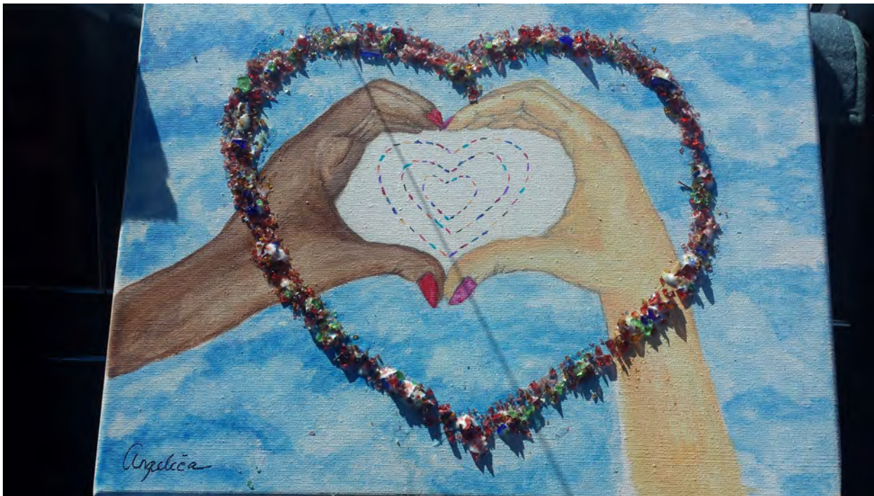
ARIZONA AREA INTERGROUP | CENTRAL ARIZONA DISTRICT

After careful consideration and a healthy discussion, GSRs declined the merger and elected chairs for both committees.